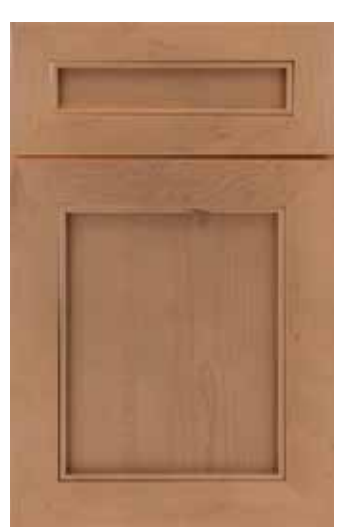
Cotter © 5-Piece Drawer Front ©