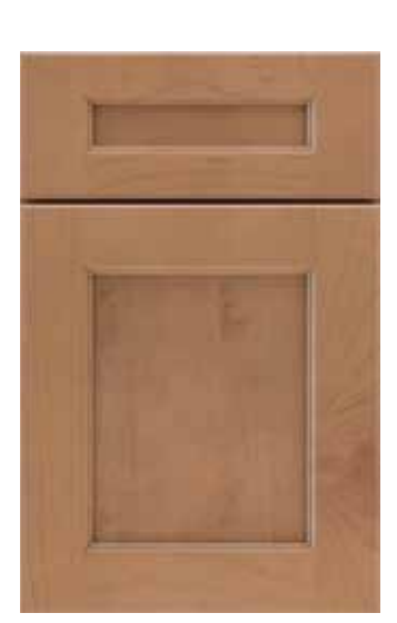
Willowby C E 5-Piece Drawer Front ©®®©