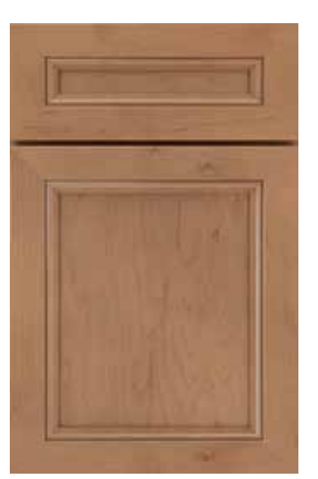
Leyton © E 5-Piece Drawer Front © M