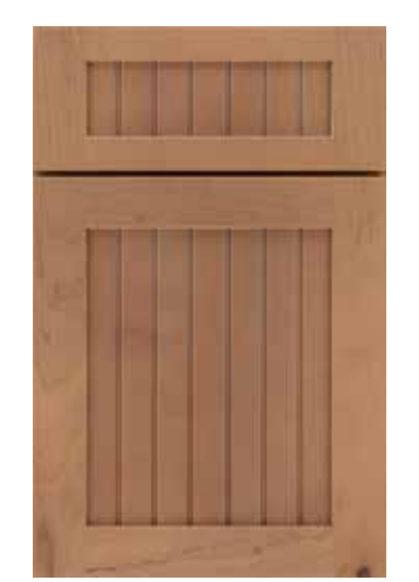
Lynnville 6 5-Piece Drawer Front C(M)