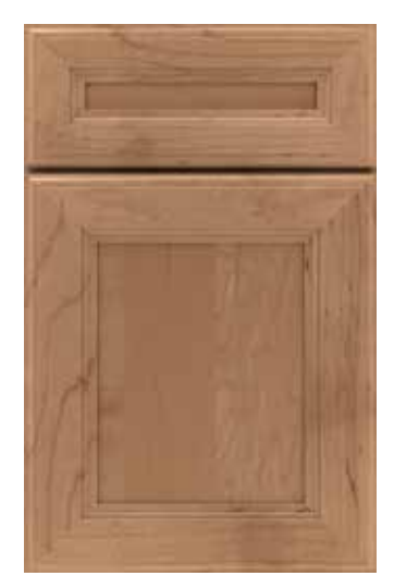
Warren © © 5-Piece Drawer Front