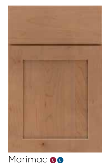
Slab Drawer Front ACOHMOR