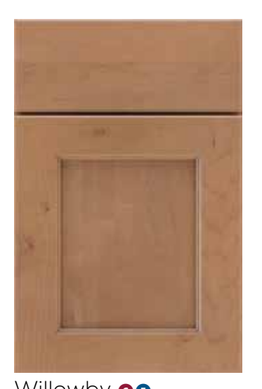
Willowby © Profiled Slab Drawer Front © © © ©