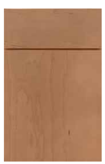
Caprice 3 6 Slab Drawer Front \bigcirc M