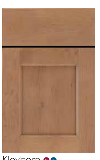
Kleyborn GE Slab Drawer Front © ®