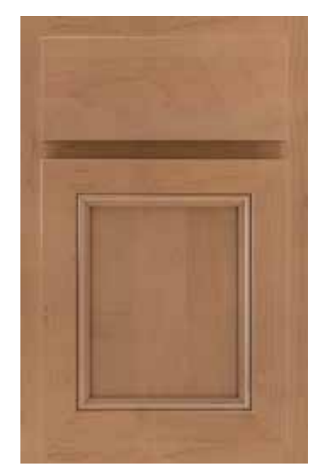
Newcomb © © Slab Drawer Front © ®