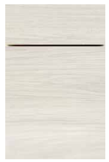
Troxel 6 Slab Drawer Front