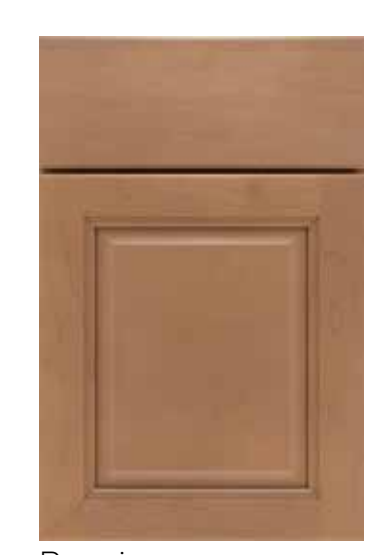
Rennie © Profiled Slab Drawer Front