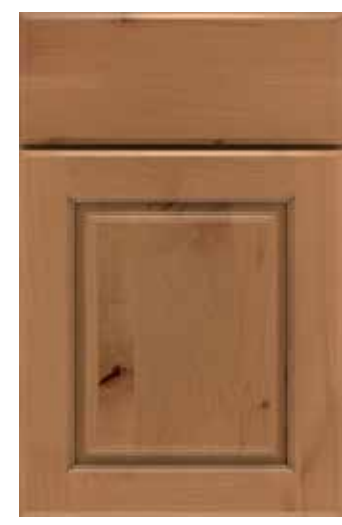
Gallatin 6 Profiled Slab Drawer Front AHR