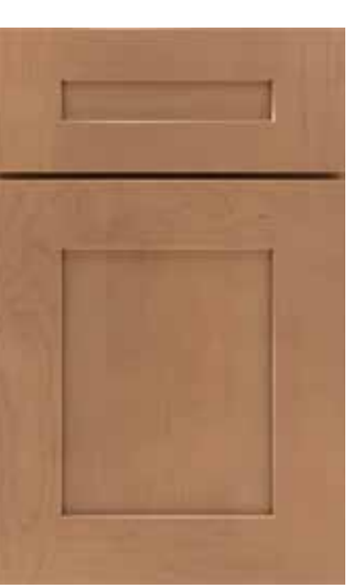
Larsen © B 5-Piece Drawer Front © M P