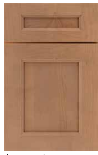
Amstead 3 © 5-Piece Drawer Front © 0 0 0 0