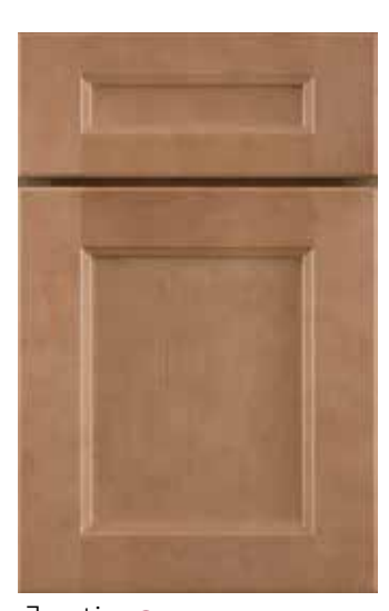
Justin • 5-Piece Drawer Front