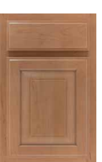
Dewitt © Profiled Slab Drawer Front ©©®®®