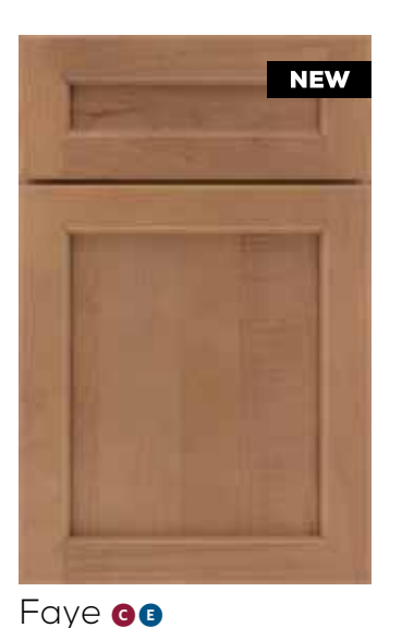
5-Piece Drawer Front © M © P