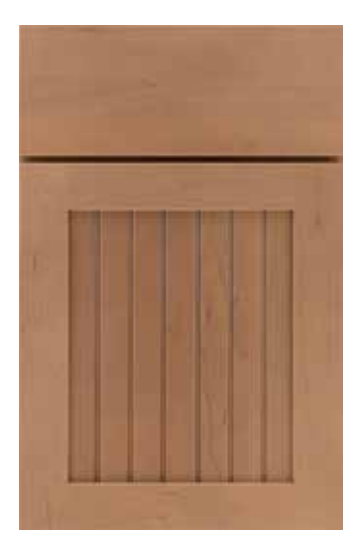
Lynnville o Slab Drawer Front \bigcirc M