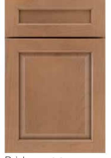
Brisbane 66 5-Piece Drawer Front 6000