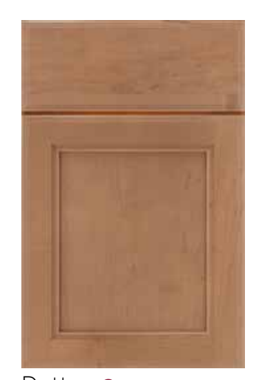
Dutton © Profiled Slab Drawer Front