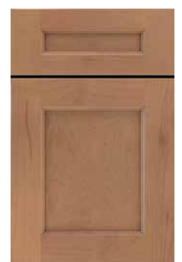
Kleyborn © E 5-Piece Drawer Front