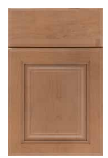
Herrington © Profiled Slab Drawer Front ©(M)