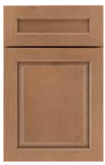
Brisbane 66 5-Piece Drawer Front 000