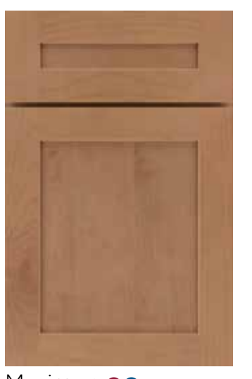
Marimac © 3 5-Piece Drawer Front @©®®®®