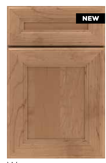
Warren G 5-Piece Drawer Front \bigcirc M