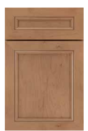
Leyton © E 5-Piece Drawer Front