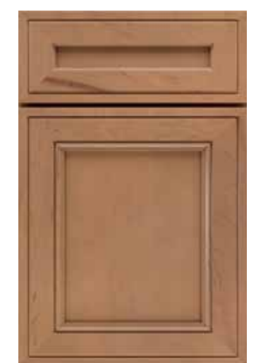
Warwick © 5-Piece Drawer Front