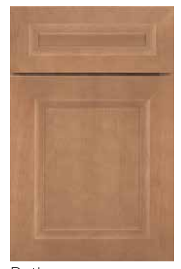
Butler 3 6 5-Piece Drawer Front