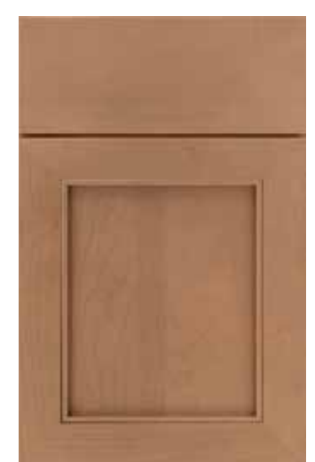
Cotter © Slab Drawer Front ©®