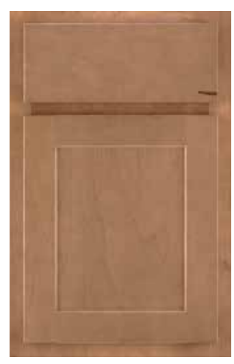
Antrim © © Slab Drawer Front © M © P