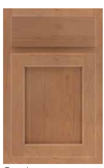
Granbury © 19 Profiled Slab Drawer Front © 1000