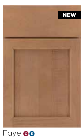
Profiled Slab Drawer Front