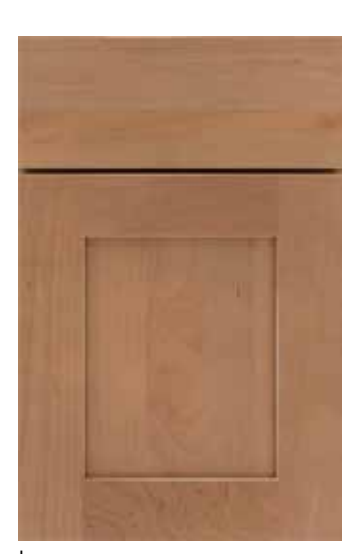
Larsen GE Slab Drawer Front ©M® P