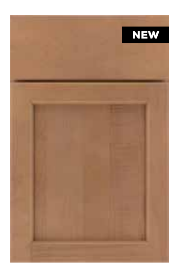
Faye © E Profiled Slab Drawer Front © ® © P