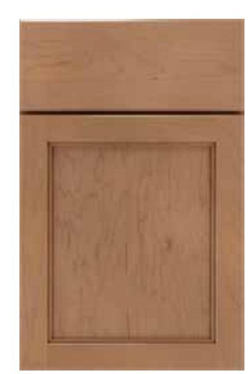
Lawton © Profiled Slab Drawer Front ©©®®