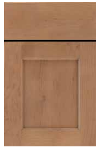
Kleyborn © (E) Slab Drawer Front © (M) (P)