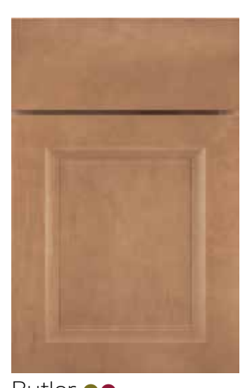
Butler BG Slab Drawer Front \bigcirc M