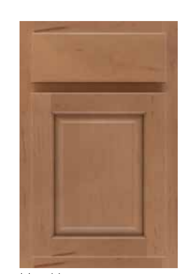
Hopkins © 3 Profiled Slab Drawer Front ©®©®