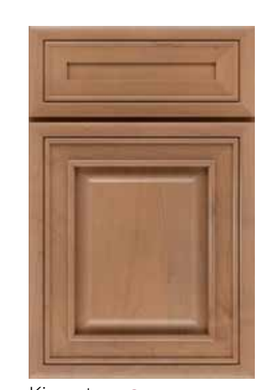
Kingston © 5-Piece Drawer Front @©@