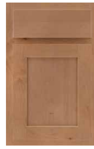
Antrim © © Slab Drawer Front (APM) © R