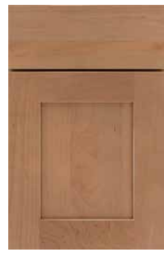
Larsen © © Slab Drawer Front ®©®®®®®