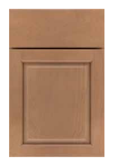
Brisbane © (5) Profiled Slab Drawer Front © (6) © (6)