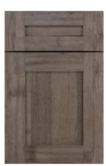
Shafer o 5-Piece Drawer Front