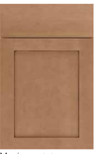
Marimac ( ) ( ) Slab Drawer Front ( ) ( ) ( ) ( )