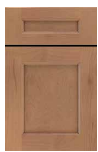
Kleyborn © © 5-Piece Drawer Front © ® ©