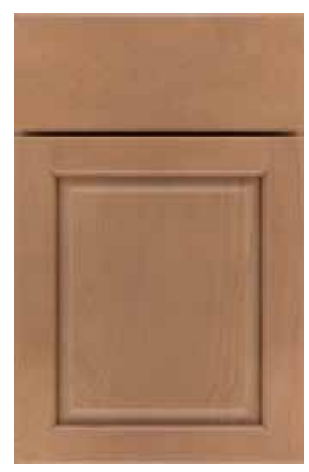
Brisbane G Profiled Slab Drawer Front ©M@