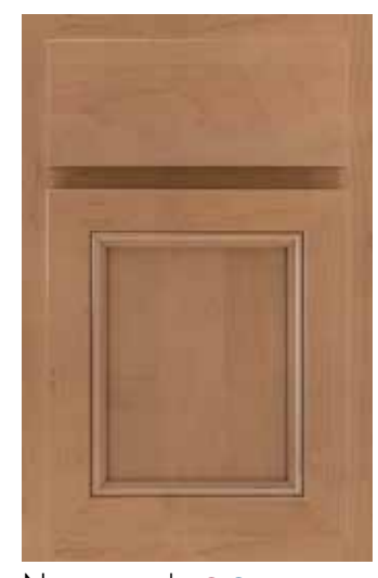
Newcomb © Slab Drawer Front © P