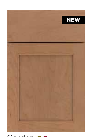
Gordon (3) (Slab Drawer Front (A) (2) (M) (R)