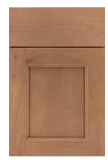
Amstead 6 6 Slab Drawer Front © 0 0 0