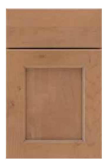
Willowby 69 Profiled Slab Drawer Front ©®®©