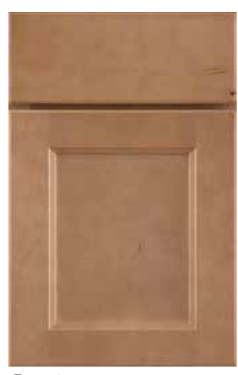
Justin © Profiled Slab Drawer Front ©®