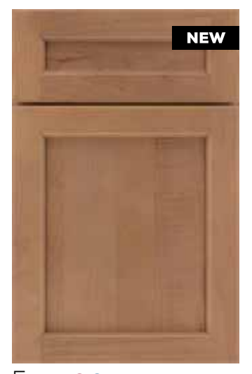
Faye © 5 5-Piece Drawer Front © ® ©