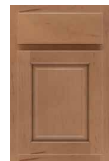
Hopkins © 3 Profiled Slab Drawer Front ©®©