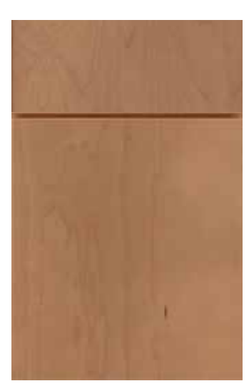
Trillian @3 Slab Drawer Front \mathbb{C}\mathbb{D}\mathbb{M}