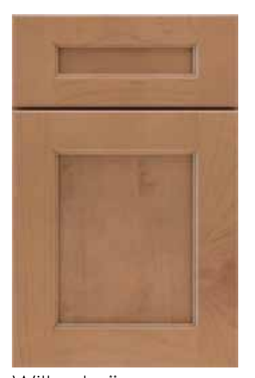
Willowby** G 5 5-Piece Drawer Front