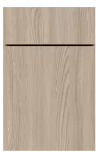
Genova © Slab Drawer Front