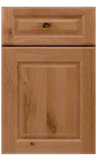
Gallatin @ 5-Piece Drawer Front AHR