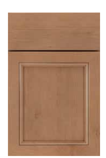
Leyton G B Slab Drawer Front CMP P