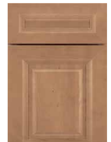
Hardin B G 5-Piece Drawer Front