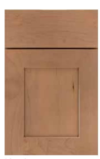
Northrope (3 (6) Slab Drawer Front (A)(2)(H)(M)(R)