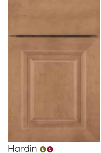
Hardin © © Slab Drawer Front © (19)(10)