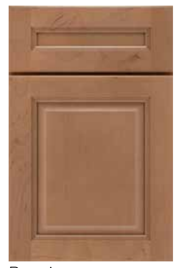
Rennie © 5-Piece Drawer Front \mathbb{C}^{\mathbb{M}}