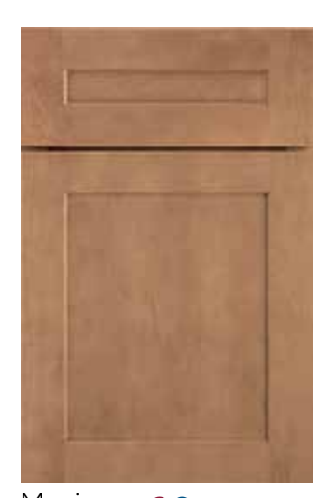
Marimac © 3 5-Piece Drawer Front © M © P