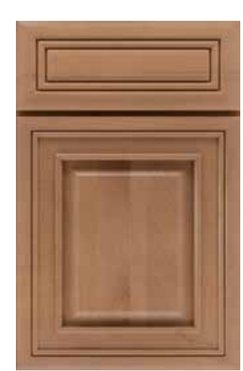
Kingston © Routed Drawer Front ©©