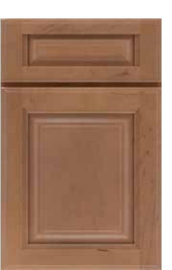
Herrington @ 5-Piece Drawer Front ©(M)