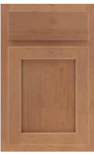
Granbury © Profiled Slab Drawer Front © ®