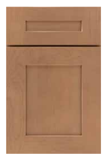
Larsen © 1 5-Piece Drawer Front @©®®©®