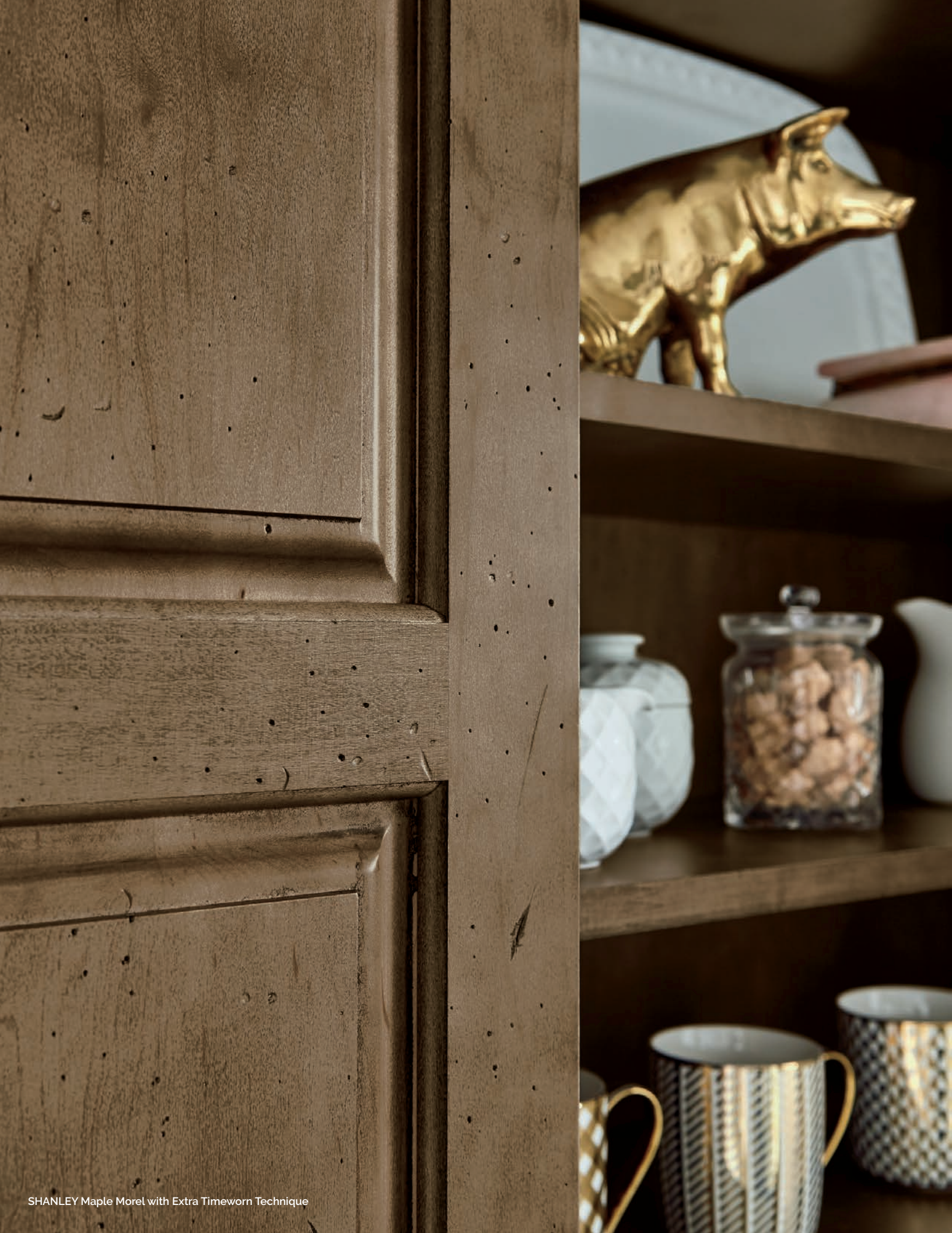
SHANLEY Maple Morel with Extra Timeworn Technique