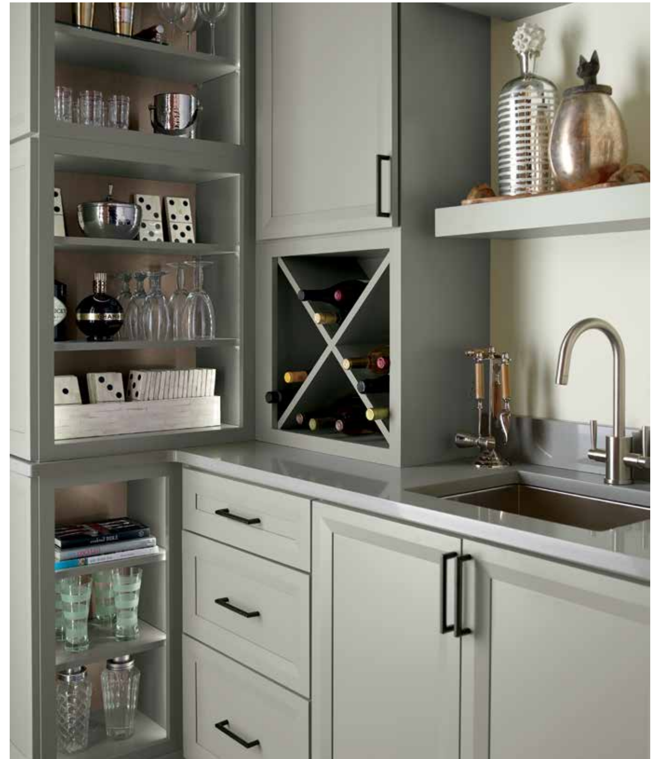
style BURKE material MAPLE finish JUNIPER BERRY PAINT