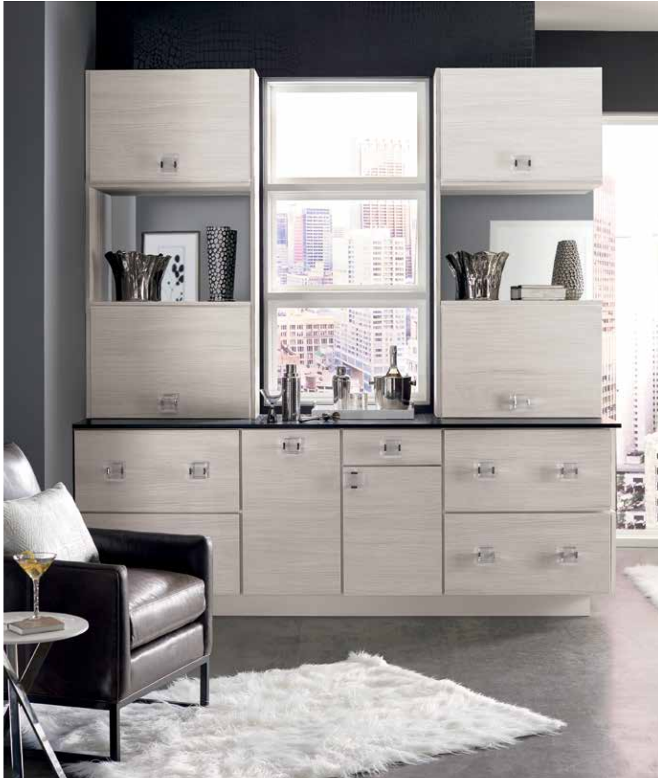
style TROXEL material SPECIALTY LAMINATE finish ARCTIC