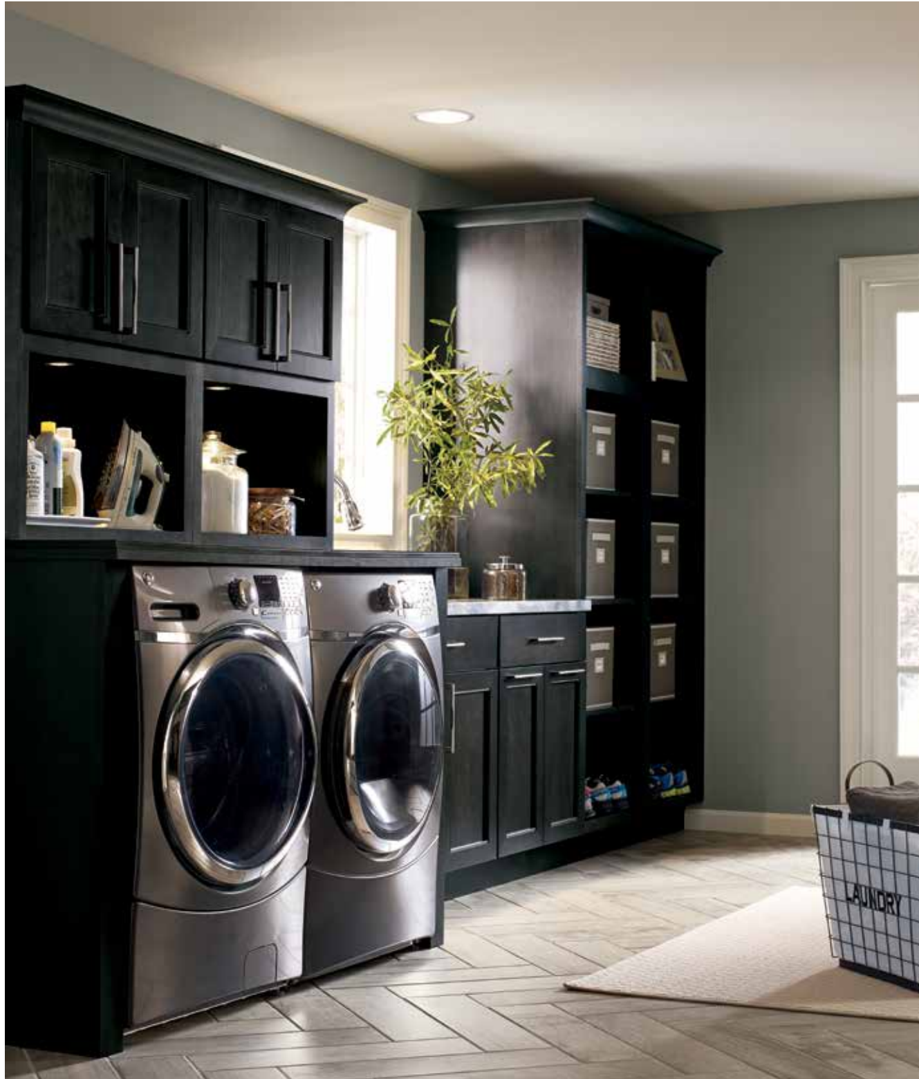
style COTTER material CHERRY finish STORM STAIN