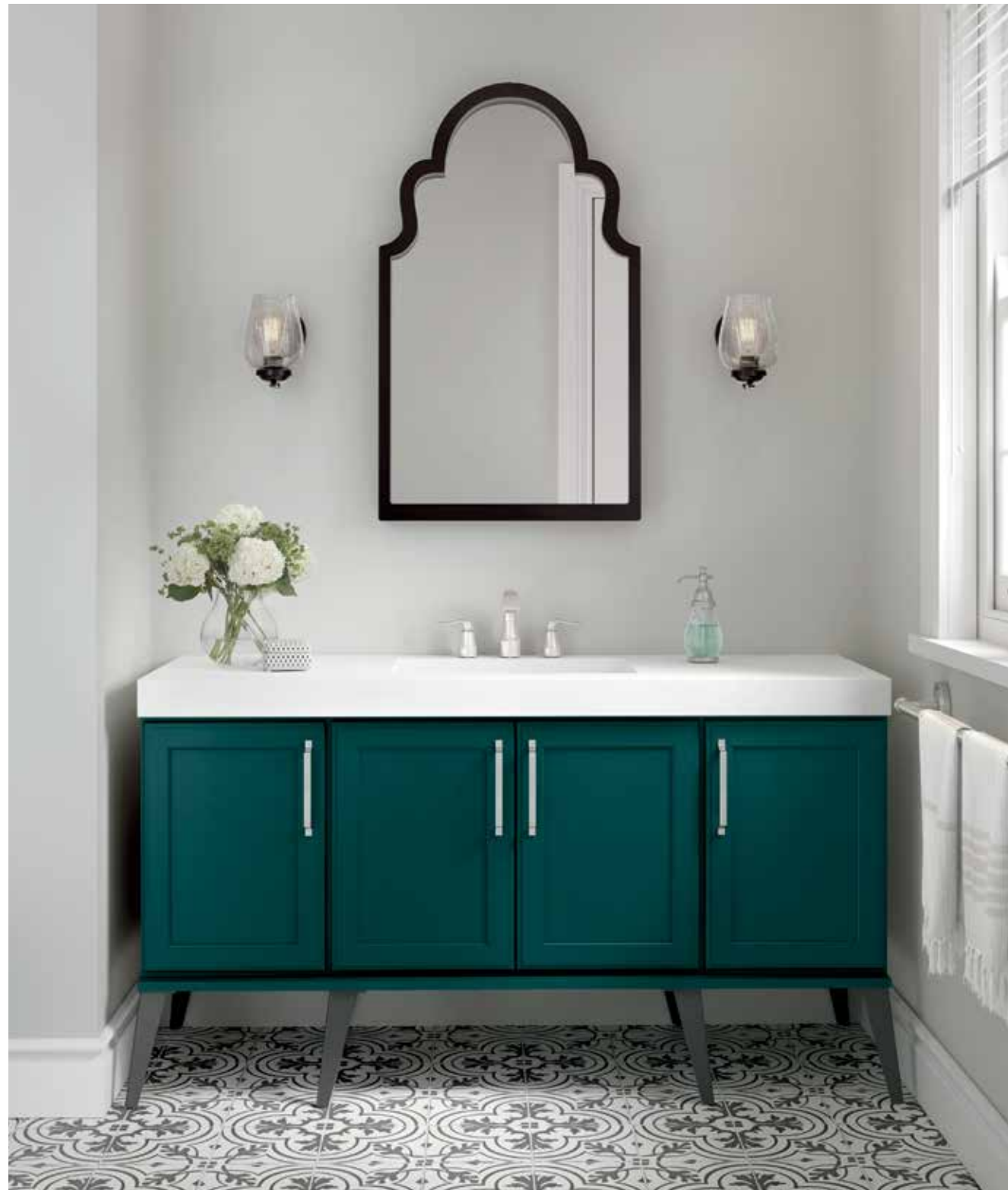
style GORDON material MAPLE finish ABYSS PAINT