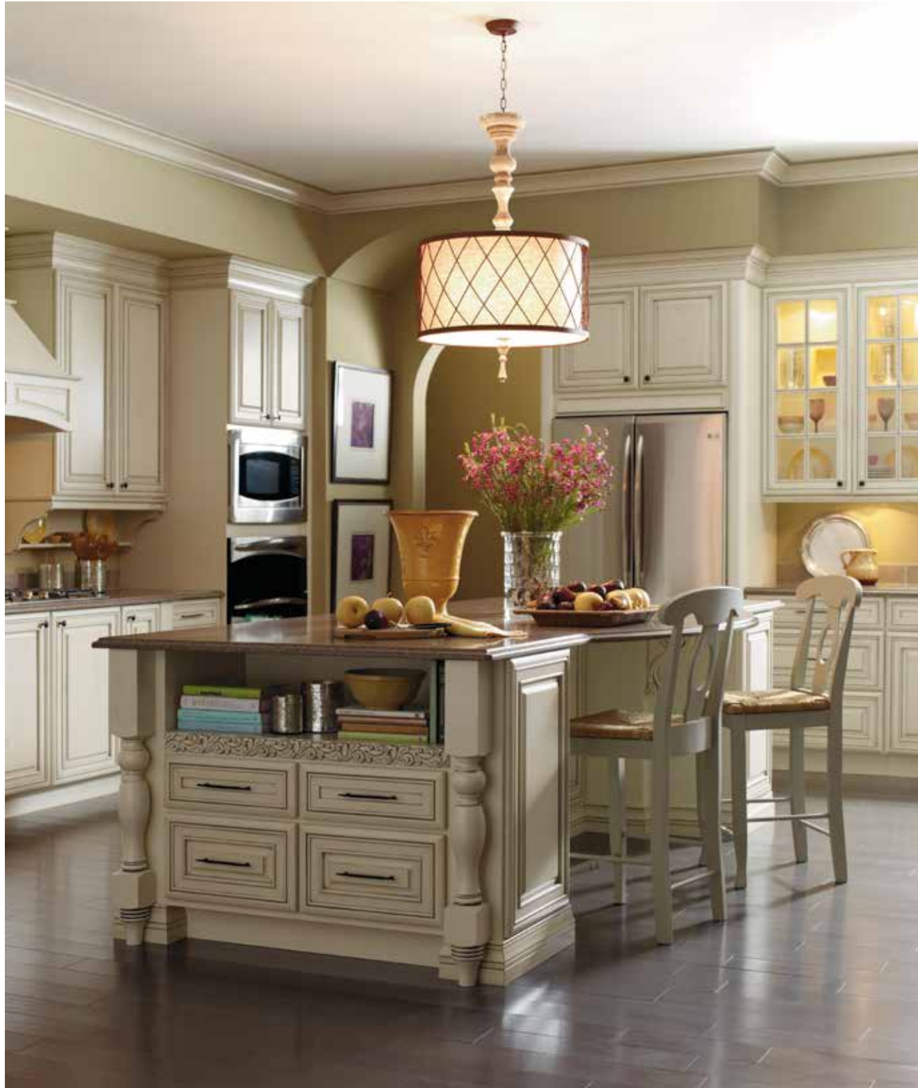
style KINGSTON material MAPLE finish COCONUT PAINT with GREY STONE FLOODED GLAZE