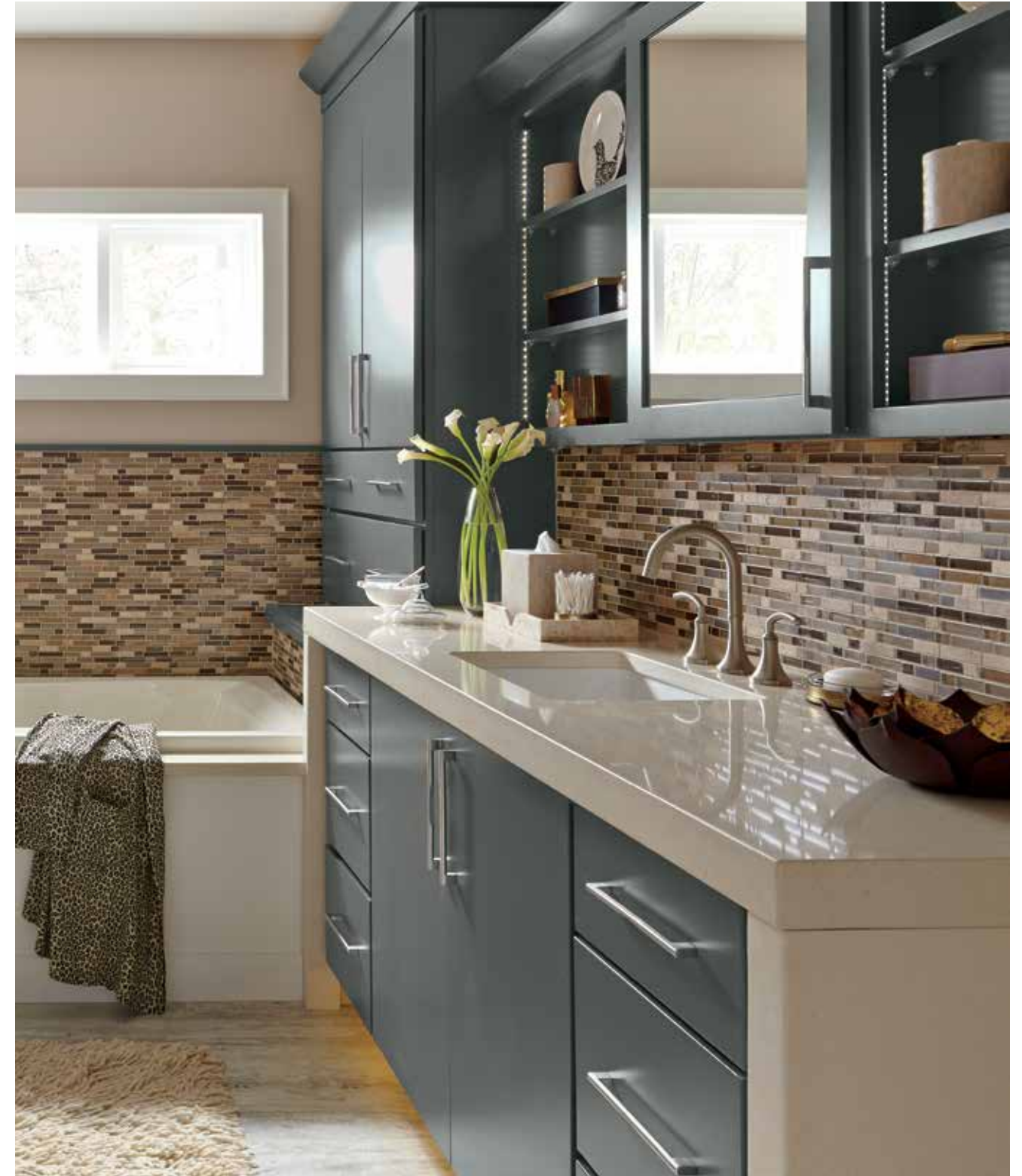
style CAPRICE material MAPLE finish MOONSTONE PAINT