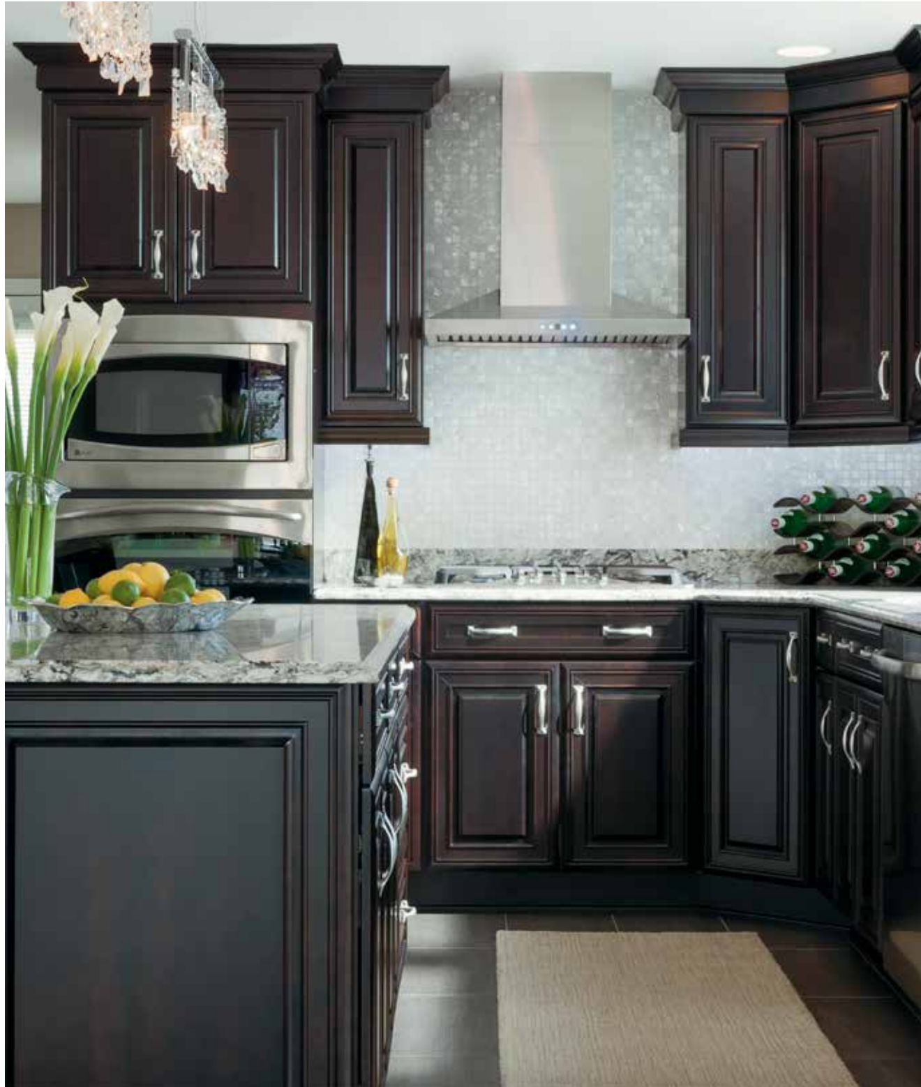
style KINGSTON material CHERRY finish CHOCOLATE STAIN