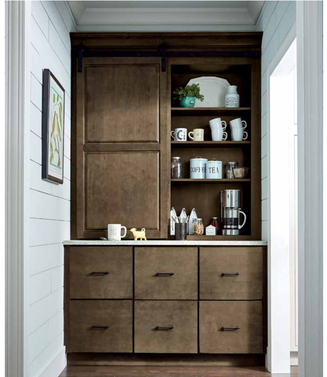
style SHANLEY material MAPLE finish MOREL STAIN Extra Timeworn Technique