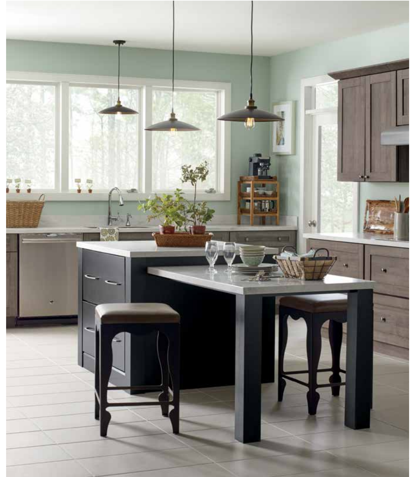
style SHAFER CAPRICE material PURESTYLE™ MAPLE finish ELK BLACK PAINT