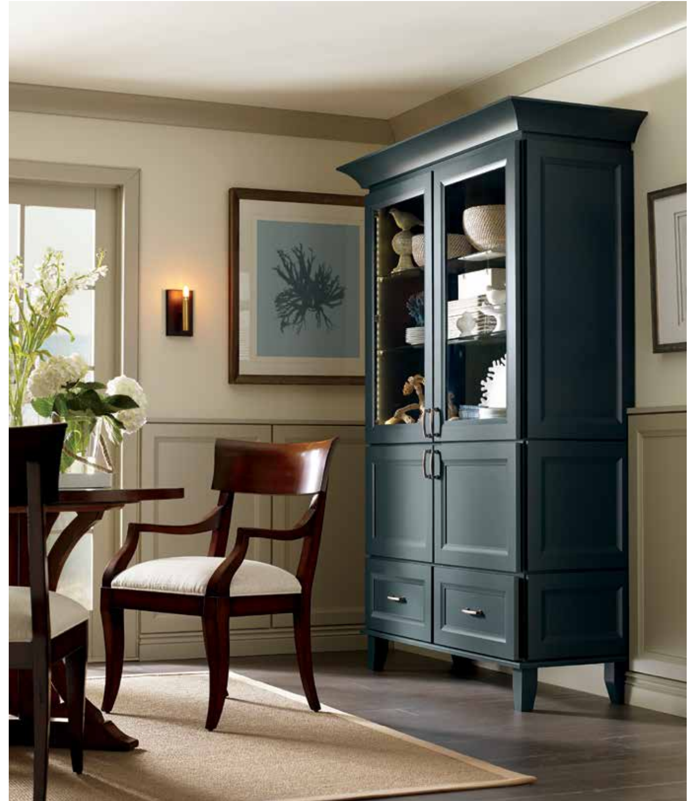
style BUTLER material MAPLE finish MARITIME PAINT