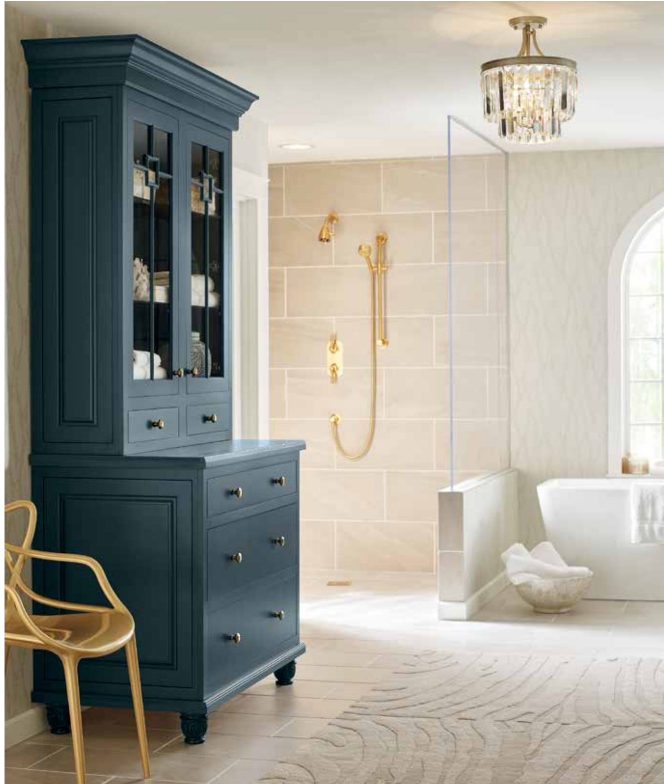
style SHANLEY INSET material MAPLE finish MARITIME PAINT