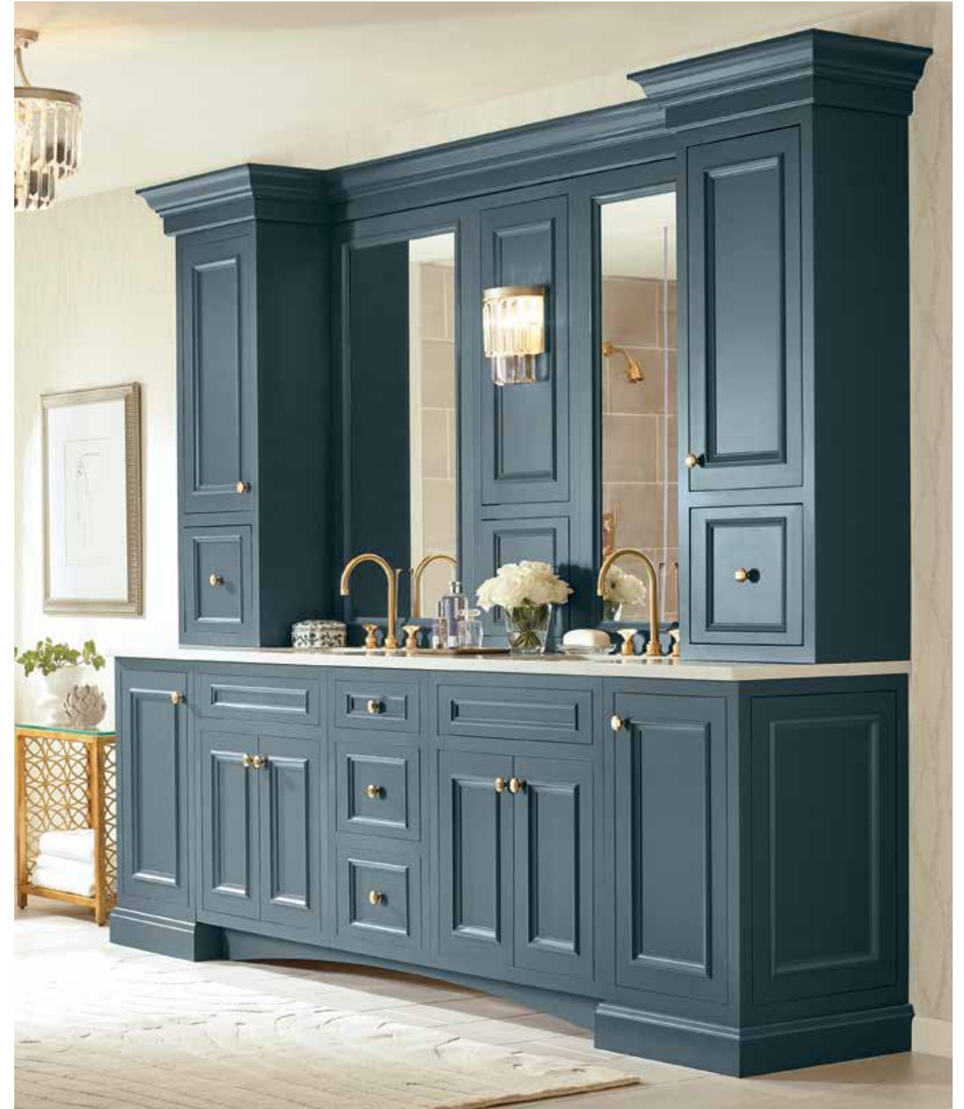
style LANDRY INSET material MAPLE finish MARITIME PAINT