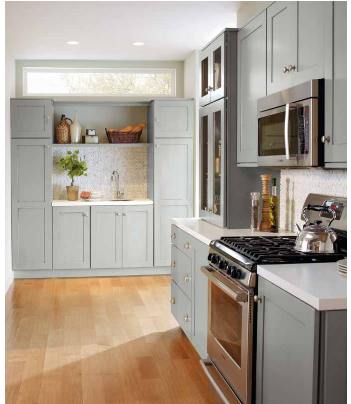
style NORTHROPE material MAPLE finish JUNIPER BERRY PAINT