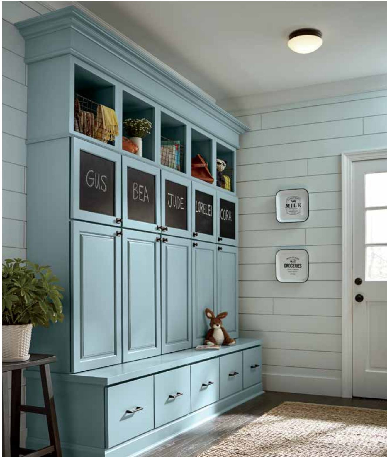
style SHANLEY material MAPLE finish INTERESTING AQUA PAINT Extra Hewn Technique